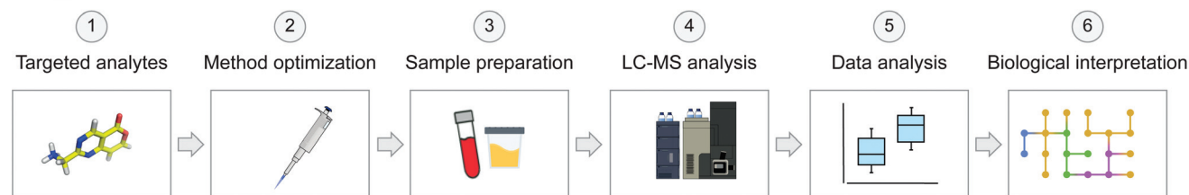
Fig. 2 Schematic representation of untargeted and targeted acquisition workflows in metabolomics studies. The untargeted acquisition workflow was reproduced from Pezzatti et al. 43 with permission from Elsevier, copyright [2019].