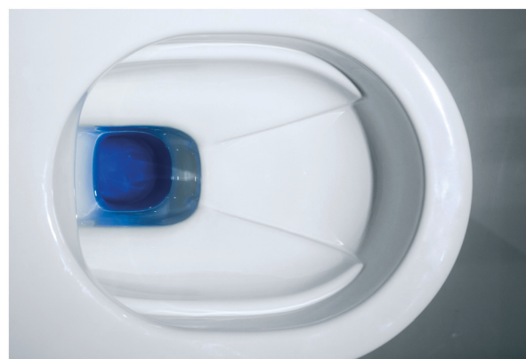
Fig. 3 The urine-separating toilet safe! from LAUFEN, implementing the urine trap. The special structures at the front-end of the toilet direct the urine towards the (nearly invisible) urine trap. 112  123