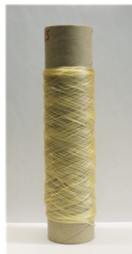
Fig. 4 Temperature sweep rheological data of PAU-86 (left) and a roll of PAU-86 fibre melt-spun at 185 °C (right).

140 °C to 220 °C at 3 °C min -1 (Fig. 4). As a result, G' and G'' intersect at 165 °C, indicating that the material starts to flow. This temperature is therefore considered as the lower limit for melt processing. On the other hand, the \tan \delta curve showed a peak at 186 °C, at which the material exhibited the most viscous character. This was considered the highest suitable processing temperature where degradation could be avoided. Therefore, the processing window of PAU-86 was set between 165 and 186 °C. In addition, another intersect between G' and G'' curves was observed at higher temperature (~210 °C), which indicated degradation and gel formation. This was confirmed by the observation that the sample after the melt rheology measurement significantly expanded with bubbles contained, and the sample became only partially soluble in THF (while the pristine sample was fully soluble in THF). The 1 H NMR spectrum of the soluble fraction of the sample after the measurement showed the signals for Monomer T (Fig. S39, ESI†), indicating the degradation of urethane units at 220 °C. This was also consistent with the previously discussed TGA results.