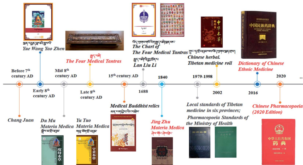
Fig. 2 The important records of P. hookeri .

the aerial parts of P. hookeri . Compound 32 is a novel iridoid oligomer. Huang et al. elucidated its structure using extensive spectroscopic analysis, including 1D-NMR and 2D-NMR experiments, and showed that it had no significant activity against