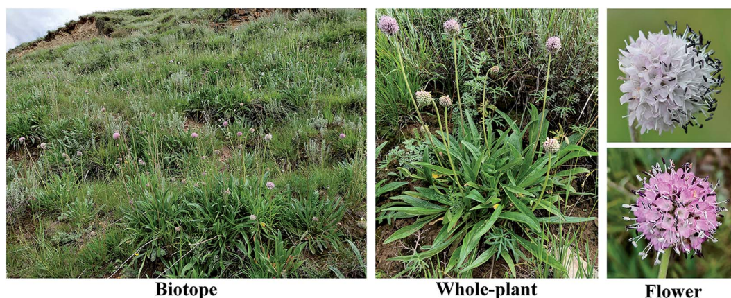
Fig. 1 Photographs of the original plant of P. hookeri in its natural habitat, the whole plant, and its flowers.

The earliest reports on iridoids in P. hookeri were published in 2000. Tian et al. separated loganin (compound 1) from the whole plant of P. hookeri for the first time, and the compound was considered the predominant compound. 15 Wu et al. reported 24 iridoids (compounds 4, 5, 7–9, 10–28). Compounds 7–11, 19–20, 27 were originally isolated from P. hookeri . The bis-iridoids may be the key ingredients which account for the anti-inflammatory effects of P. hookeri , and compounds 7, 8, 27 can inhibit TNF- \alpha -induced NF- \kappa B-dependent promoter activity. 22–25 Furthermore, Zhang et al. isolated three iridoid glycosides from the 95% ethanol extracts from the whole plant of P. hookeri in 2014, namely, loganetin (compound 2), 5-[3-(1-hydroxyethyl) pyridine], 7-loganin ester (compound 29), and dipsanoside A (compound 30), using chemical methods and spectral analysis. 16 In addition, Huang et al. isolated two iridoid glycosides (compounds 31, 32) from the 95% ethanol extracts of