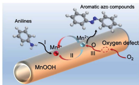
Scheme 1 The proposed catalytic process for oxidative coupling of anilines using NT-MnOOH.

Fig. 4c and d exhibit the selectivity of 1,2-diphenyldiazene as functions of the surface Mn 3+ level ([ΔAOS]) and surface oxygen defect abundance (O 2- /OH - ratios). Both high levels of surface Mn 3+ species and the large amount of surface oxygen defects facilitated the improvement of the selectivity of 1,2-diphenyldiazene. The NT-MnOOH-12 catalyst with the lowest surface Mn 3+ level and the smallest amount of surface oxygen defects exhibited the lowest selectivity towards 1,2-diphenyldiazene. Comparatively, other NT-MnOOH- t catalysts yielded at least 99.3% selectivity (Fig. 4c and d). Among them, the NT-MnOOH-8 catalyst with the optimized surface properties delivered the best chemoselectivity towards azo compounds.