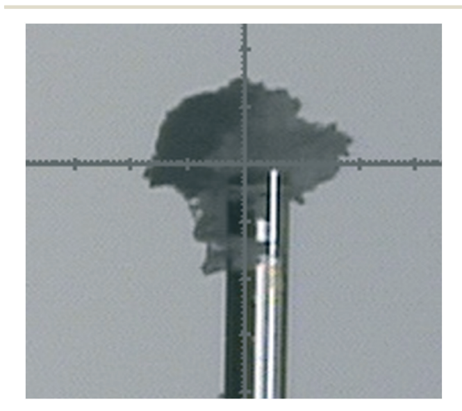
Fig. 1 A very small amount of powder ( ca. 0.01 mg) mounted on the top of a glass fibre in the single crystal X-ray diffractometer. Each major tick represents 0.1 mm.

Of the 15 materials studied, 14 (Table 1) were solved to a high degree of accuracy using DASH. Only \gamma -carbamazepine