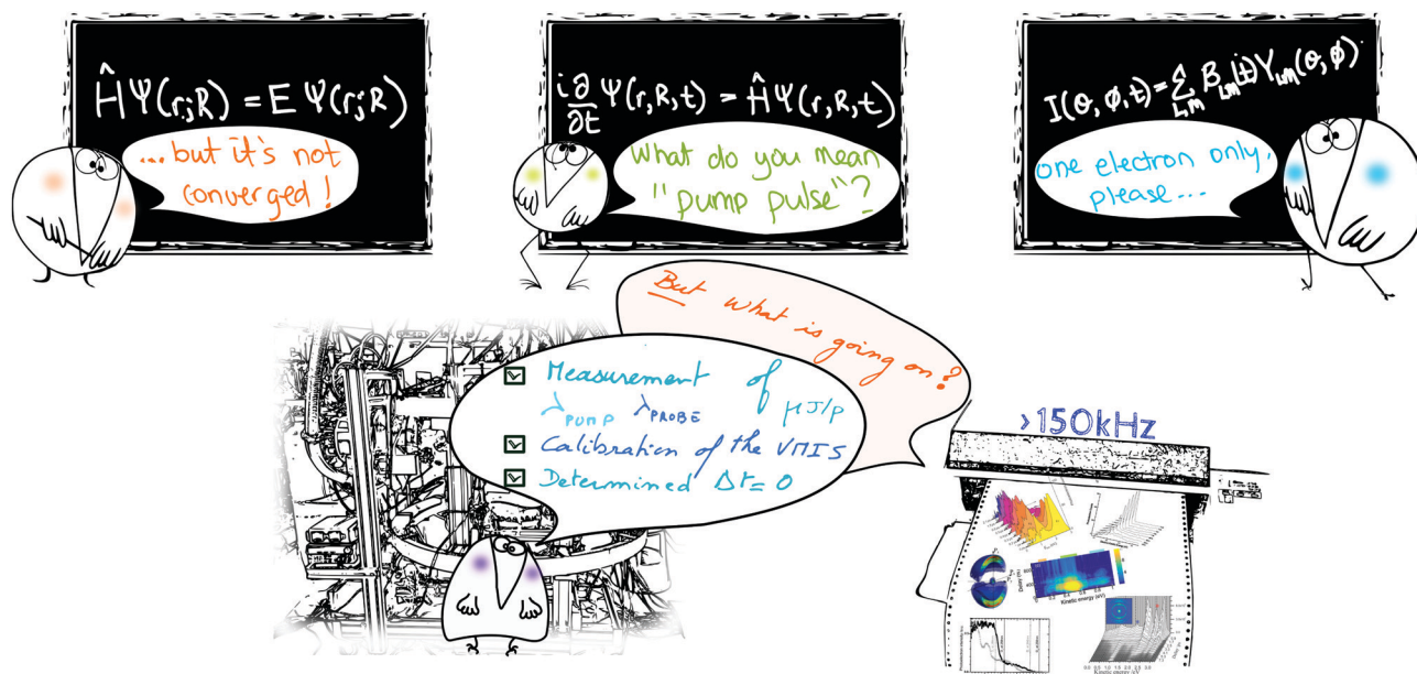
Fig. 2 A Shadoks' view of time-resolved photoelectron spectroscopy for new users: a joint analysis of experimental and theoretical data leads to a quantitative interpretation of the photodynamics.

of the full-dimensional surface is that it enables a level of convergence and quantitative accuracy that is often inaccessible to ab initio on-the-fly approaches.