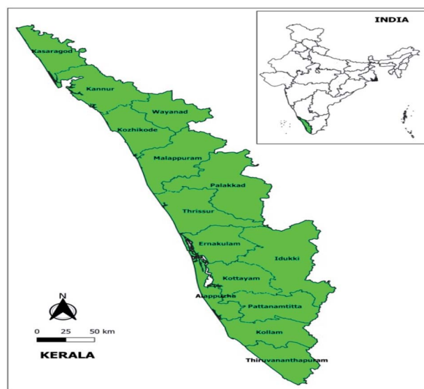
Fig. 1 Study area – Kerala.

Kerala is wedged between the Arabian Sea in the west and Western Ghats in the east with an area of approximately 38 863 km 2 and the width varies between 35 and 120 km. The entire state of Kerala can be divided into three geographical regions, the eastern mountainous terrain, the central midlands (rolling hills), and the western coastal plains. The eastern mountainous highlands rise to an average height of 900 m, with a number of peaks well over 1800 m in height. It accounts for 48% of the total land area of Kerala. The Midlands, lying between the mountains and the lowlands, is made up of undulating hills