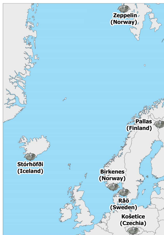
Fig. 1 Locations of the six EMEP/MONET sampling sites across Europe included in this study.

Detailed information on sampling site locations and EMEP sampling and analytical procedures is provided in Table S1 in the ESI.† A map of the sites is provided in Fig. 1. MONET PAS is performed using polyurethane foam (PUF) disk samplers (PUF-