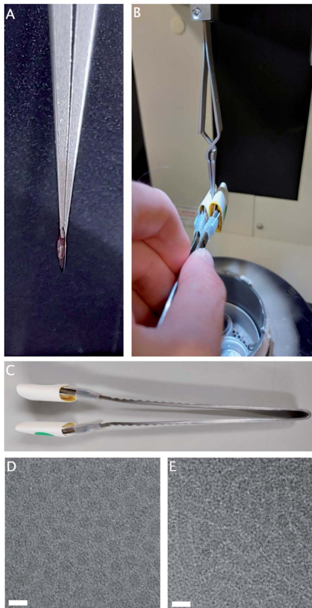
Fig. 1 (A) Insufficient blotting of a gelled sample. A thick gel can be seen on the grid after blotting. (B) Manual blotting of the sample before lowering the environmental chamber using custom-made blotting forceps. (C) Custom-made blotting forceps with widened areas near the tip to affix filter paper. (D) Electron micrograph of gel sample frozen from room temperature, showing individual round micelle-like structures. (E) Electron micrograph of gel sample frozen from 37 °C, showing tubular structures. White bar 20 nm.

The small volumes involved in plunge-freezing provide very little resistance to temperature change, therefore strict temperature regulation is hard to maintain while transferring samples from tubes to grids. A separate sample consists of