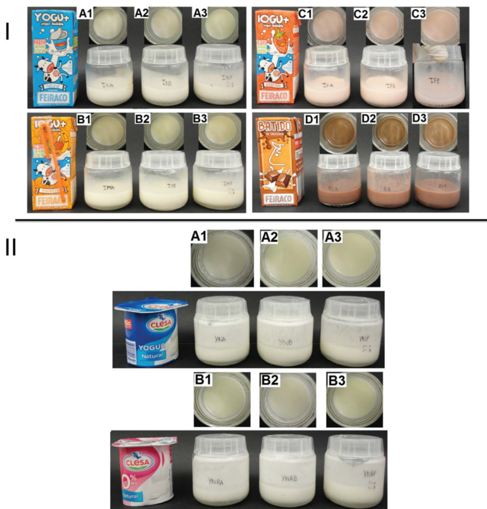
Fig. 3 Different emulsion appearances of the 40% of the RDA (EPA + DHA) from fish oil with 10 mM \alpha -CD and 9 mM \beta -CD in the product tested. I-A natural milkshake, I-B fruit salad milkshake, I-C strawberry milkshake, I-D chocolate milkshake whole milk, II-A natural yogurt, and II-B 0% natural Yogurt; control (A1–D1), 20% EPA + DHA from fish oil (A2–D2) and the 40% of the RDA (EPA + DHA) from fish oil plus 1% vanillin (A3–D3).

CDs created a powder. The addition of honey and maltodextrins increased the viscosity, density, and stability. The new product remains stable for 3 months at 4 °C. Finally, the addition of the Milk-similar food model (0.1 M phosphate citrate at pH 6.51) mixing for 15 min solubilized the previous aggregation and the solution remained stable for 1.5 months at 4 °C. The sensory panel generally approved and liked the products (8/10).