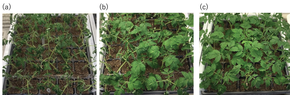
Fig. 2 Optical photographs showing the growth of tomato plants after 15 days (a) without adding GO in the soil during soil hydration, (b) with the addition of GO dispersion ( 0.1\text{ mg mL}^{-1} ) in the soil during soil hydration and (c) with the addition of GO dispersion ( 1\text{ mg mL}^{-1} ) in the soil during soil hydration.

The statistical significance was assessed through Tukey's test ( P < 0.05 ). Obviously, the average (mean) weight of tomato plants increases with increasing the concentration of GO dispersion during the soil hydrolysis process. The average fresh weights of tomato plants are 0.92, 1.12 and 1.20 g for the concentration of the GO dispersion of 0.00, 0.10 and 1.00\text{ mg mL}^{-1} , respectively. The above results clearly demonstrate the benefit of GO dispersion in the tomato plantation during soil hydrolysis.