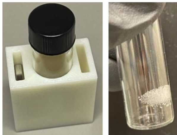
Fig. 2 Left: 3D printed holder containing the binary mixture of RE elements at 2 mm distance to a \text{Fe}_{14}\text{Nd}_2\text{B} magnet. Right: Crystals formed near the magnet after holding the binary mixture solution at the magnet for 72 h at 3 °C.