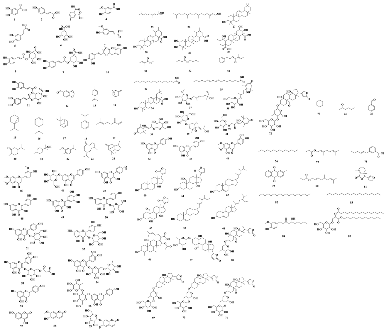
Fig. 2 Chemical structures of the reported compounds from C. olerius .

hydroxytoluene (BHT). The overall quantity of phenolic components in the extracts was linked to their antioxidant properties. Samples with elevated phenolic content demonstrated stronger antioxidant activity. 11