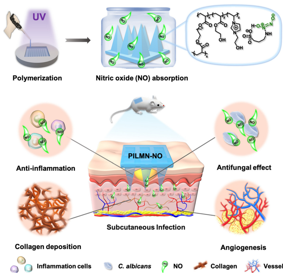
Scheme 1 Schematic illustrating the synthesis of NO-releasing imidazolium-type PIL-based microneedle patches (PILMN-NO) and corresponding fungi killing, anti-inflammation, collagen deposition and angiogenesis activities for promoting infection elimination and accelerating wound healing.

formation of intramolecular hydrogen bonds, indicating that the formed hydrogen bond stabilizes the structure. These results prove that PIL can combine NO by the formation of NONOate groups. PILMN was developed and kept under a saturated atmosphere of NO to prepare PILMN-NO. Similar FT-IR results were obtained in PILMN-NO, suggesting the combination of PILMN and NO by forming NONOate groups. Four new peaks appeared at 823, 1259, 1341 and 1552 \text{cm}^{-1} (Fig. 1b), revealing that PILMN is capable of absorbing NO, confirming the synthesis of NO-adsorbed MNs. Additionally, the predicted chemical shift of the hydrogen bond by quantum chemical calculations is 11.05 ppm, and the predicted peaks of \nu(\text{N-N}) and \nu(\text{N-O}) are located at 836, 1259, 1335 and 1526 \text{cm}^{-1} , which are close to the experimental results, as shown in Fig. 1c. All the above results indicate that NO has combined with the \text{APS}^- in PIL by the formation of NONOate groups.