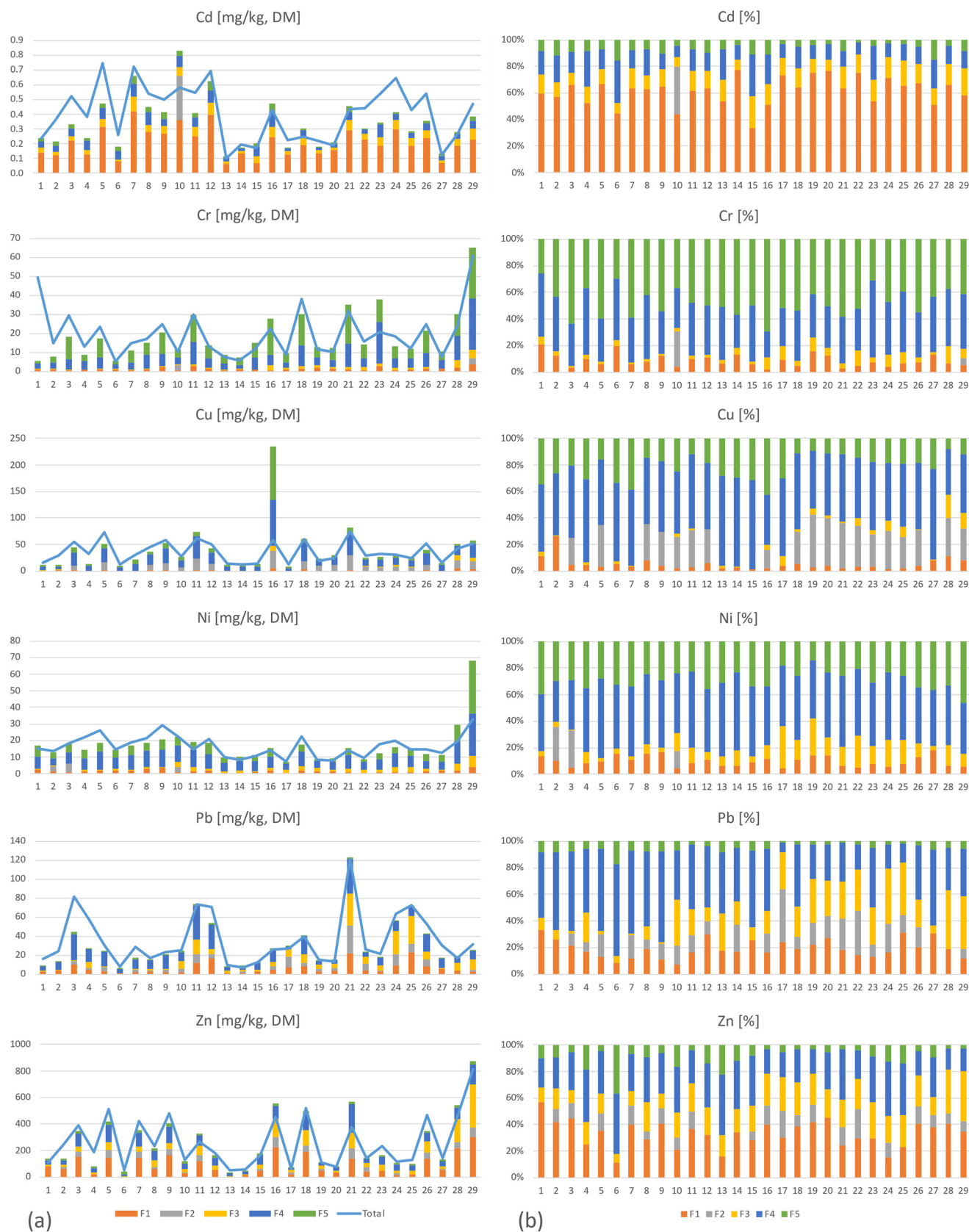
Fig. 4 Fractionation of Cd, Cr, Cu, Ni, Pb, and Zn for all sites (1–29). (a) The graphs to the left are reported as total concentrations ( \text{mg kg}^{-1} , DW), while those (b) to the right report the distribution between fractions (%).