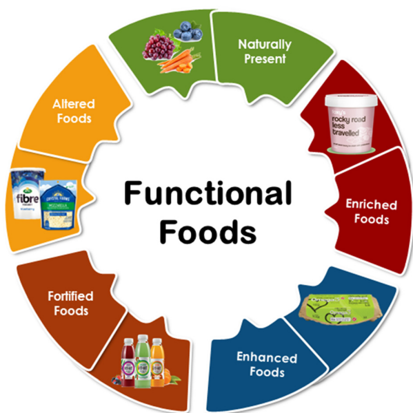
Fig. 1 Categorization of functional foods.

Over the last few years, polyphenols have attracted increasing interest due to their numerous bioactive and health-promoting properties, such as antioxidant, antimicrobial, and anti-inflammatory, 1 and thus are considered excellent candidates as bioactives in health-promoting and disease-preventing functional foods.