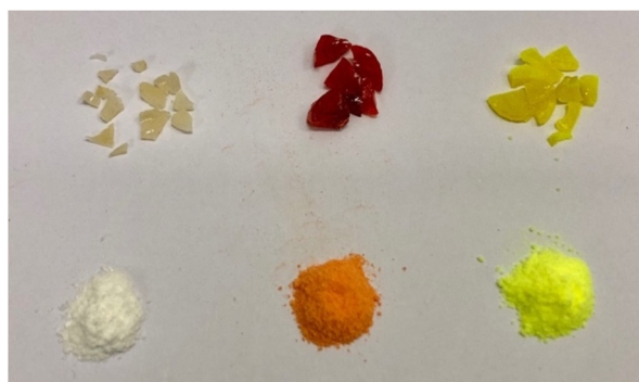
Fig. 2 ROCOP polymer samples; powdered products are shown below the corresponding melt-cast samples. From left to right, PA-CHO, AAQ-PA-CHO (0.2%), Nap-PA-CHO (0.2%).

a Conditions: [Ep] 0 : [Anh] 0 : [Al] 0 : [DMPA] 0 = 400:400:1:2 in toluene; conversion based upon anhydride signals in 1 H NMR spectra. Polymer was dried in a vacuum oven at 80 °C overnight. b 3.16 mmol 3 . c 6.4 μmol 3 . d molecular weights measured by triple-detection GPC. e No observable transition in the DSC data. f Ester signals observed but ether signals obscured by chromophore and so %ester cannot be determined reliably. g From the polymerization of PA and CHO obtained from the depolymerization of entry 2.