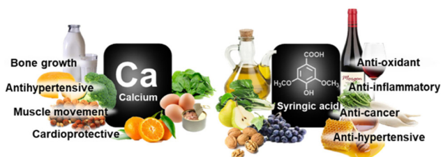
Fig. 1 Occurrence and bioactivity of CaSyr-1 building blocks.