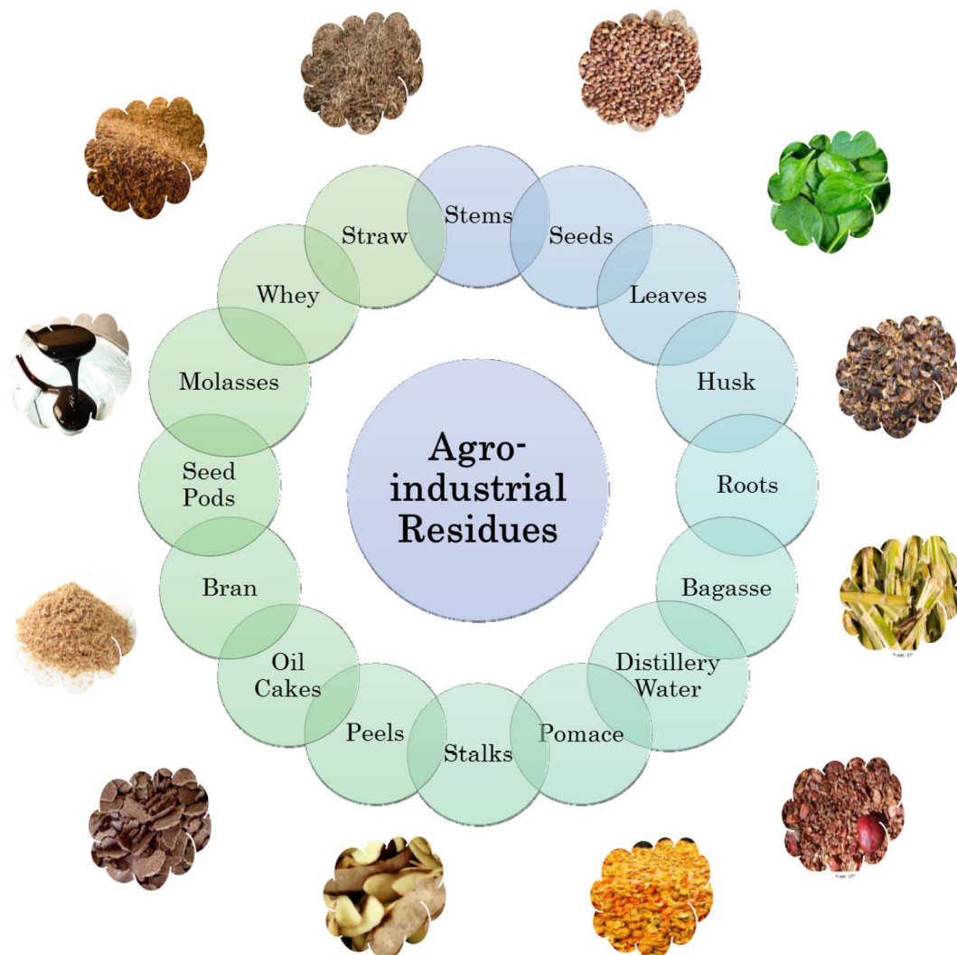
Fig. 4 Different agro-industrial residues used as substrate during biosurfactant production.

5.1.1. Vegetable oil and (oil) wastes. A large amount of waste residues formation occurs during the oil extraction in various oil industry. These left over products includes oil cakes, oil soap stocks, by-products rich in fat content, semisolid and water soluble effluents, fatty acid residues etc. 64