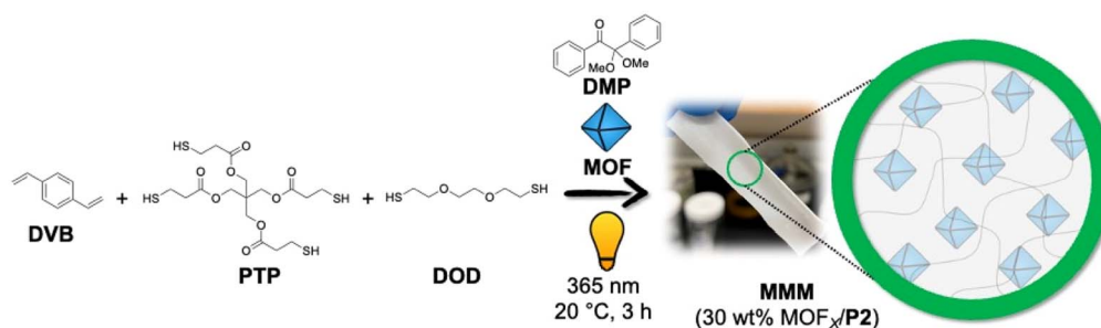
Fig. S5 Scheme for synthesizing P2-based (control, not self-healing) MMMs with 30 wt% MOF-loading using thiol-ene 'photo-click' polymerization.