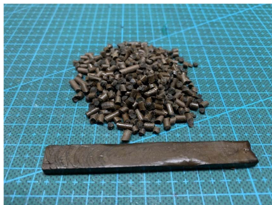
Fig. 18 100% natural biomass biodegradable thermoplastic material made from wood, stone and natural deep eutectic solvent. 86

from non-edible cheap materials, namely wood and stone. 86 The weight of wood and stone is over 51% and various types of waste wood, plant and paper can be utilized. Moreover, this material can be manufactured easily with a normal twin extruder, which is an advantage for industrial use. The important point is that this material can be quite cheap given that the raw material and manufacturing cost will be economically friendly. A disadvantage is its weak water resistance, which is an issue for real industrial applications. However, this material has a relatively high compatibility with various type of bioplastics and petroleum-derived plastic such as PHBV, PP, and PE and water resistance can be recovered when it is mixed with other plastics. Given that a high quantity of material can be mixed with other plastics, we expect that it will be used as bulking agent for other plastics to increase their biomass content and biodegradability. Furthermore, marine biodegradability can be expected for this material, which is under investigation.