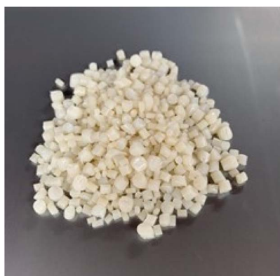
Fig. 7 Starch-based biodegradable plastic prepared with twin-axis extruder composed of 100% biomass. 54

environmentally friendly and ideal in the aspect of not competing with human nutrition. Ngai et al. highlighted the importance of chemical modification to improve the hydrophilicity of cellulose for it to possess water resistance and mechanical strength. They also demonstrated the preparation of cellulose ester-based bioplastic for food packaging application via solvent casting, bar coating, spray coating and immersion coating (Fig. 8). 55 Wang et al. prepared a cellulose-based bioplastic by hot pressing a cellulose hydrogel. The cellulose hydrogel was prepared from cellulose solution in an alkali hydroxide/urea aqueous system by physical cross-linking. The hot-pressing process induced a transition in the aggregated structure in the cellulose resin, resulting in plastic deformation. It was elucidated that the radial orientation of the cellulose molecules occurred in the planar direction of the plate, whereas an increase in amorphous zones appeared in the vertical