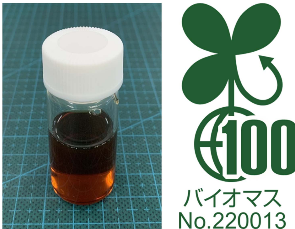
Fig. 27 (Left) 100% biomass mark certified water-based coating material. (Right) 100% biomass mark from JORA. 116