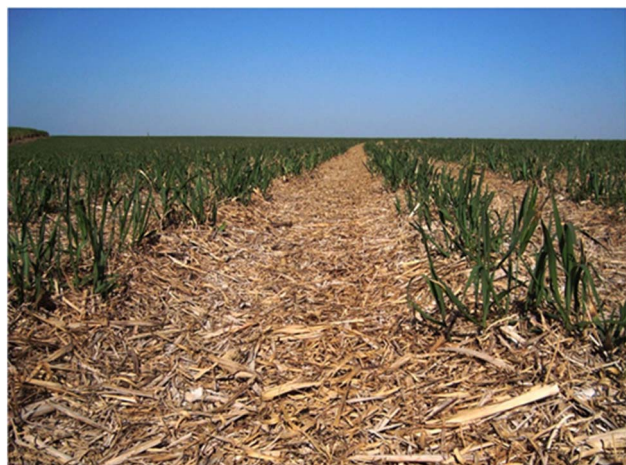
Fig. 39 Recent view of sugarcane cultivation under green cane management conducted without the preharvest burning in Brazil. The trade-offs between the need to preserve soil health and produce more bioenergy have been the subject of intense discussion, given that the adoption of sustainable management practices such as crop residue retention can increase the productivity of agricultural ecosystems and mitigate the effects of climate change through enhanced carbon sequestration. 174

crude palm oil. It was demonstrated that when PLA and crude palm oil were used as cross linkers, the strongest tensile strength of 5.24 MPa and lowest elongation at break of 3.49% were obtained. It was also elucidated that the strong interaction of triglycerides (C=O stretching) was observed for all 3 types of films. 182