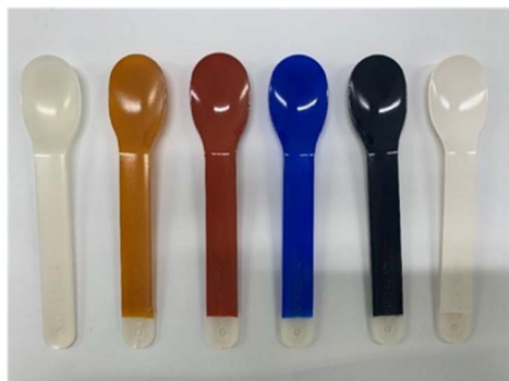
Fig. 22 100% biomass biodegradable color ink on 100% biomass biodegradable plastic spoon.

UV (ultraviolet) curable polymers have been employed in various types of products including hard coatings, adhesives, paints, inkjet ink, glue, 3D printer ink, cosmetics, dental products, and medical products. 108,109 There are some investigations that demonstrated the possibility of obtaining biomass-derived UV curable polymers derived from furfural etc. 110 Sangermano et al. also studied the preparation of bio-