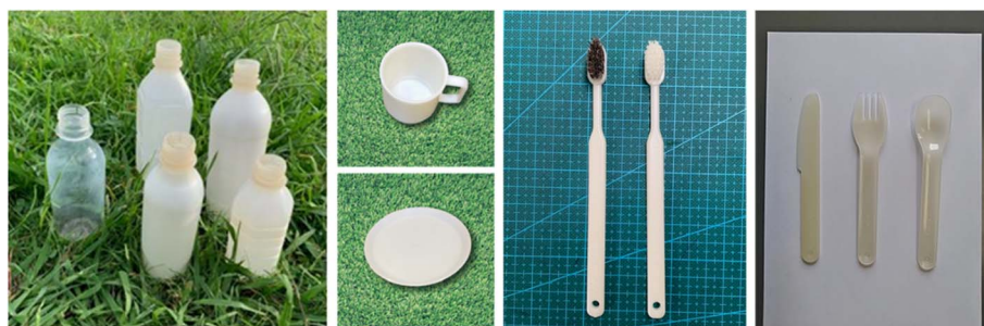
Fig. 11 From (Left), bottle, cup, tray, toothbrush, and cutlery, all with 100% biomass biodegradable plastic composition. Brush part of tooth brush (Left) is made of natural brush although toothbrush (Right) is made of petroleum-derived plastic. 59

In addition, nanocellulose has a low coefficient of thermal expansion and does not expand, extend or change its shape