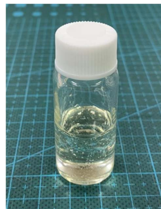
Fig. 30 Natural deep eutectic solvent-based lubricant with 100% biomass composition.

Alternatively, DESs have also been studied as a potential bio-based lubricant when they are composed of biomass-based chemicals. 138 Li et al. employed a betaine and sugar alcohol-based natural deep eutectic solvent as a lubricant. My group also had developed 100% natural biomass-based lubricants and cutting fluid using natural deep eutectic solvent technology (Fig. 30).