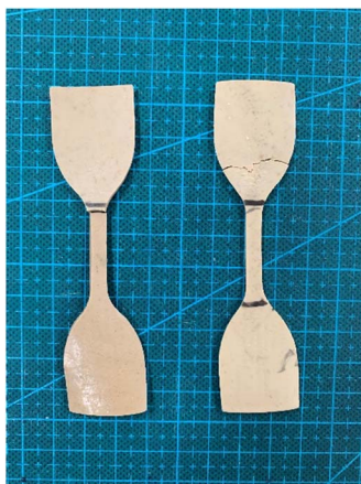
Fig. 33 Dumbbell test piece of (Left) natural rubber and (Right) natural rubber nano cellulose composite material. 180