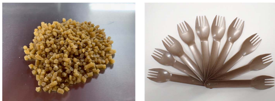
Fig. 42 100% biomass biodegradable resin pellet (Left) and forks (Right) made from Sargassum waste.

to be considered for overall environmental sustainability of a product, it is necessary to acquire a better understanding about the energy demand of bioplastics in the manufacturing process. Schulze et al. investigated on the energy demand of bioplastic materials in injection molding, milling and fused deposition modelling 3D printing procedure in the aspect of manufacturing process. Based on this concept, a quantitative energy related assessment of manufacturing bioplastics in comparison to conventional petroleum-derived plastics could be also possible. It was elucidated that in the case of the energy demand per product, milling has the highest specific energy demand and injection molding demonstrated a lower specific energy demand, but is compromised by the energy required for initial warm up and preparation of the machine. Considering these facts, 3D printing has the lowest energy demand. It was also shown that processing bioplastic and petrochemical