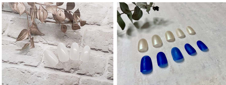
Fig. 17 100% biomass biodegradable fake (artificial) nail tips (Left) and water-based biomass nail polish (Right). 84,85

With the aim to create ultimate environmentally friendly products, 100% natural biomass biodegradable thermoplastic materials made from wood and stone were created (Fig. 18). A new material called a 'natural deep eutectic solvent' was applied to make this innovative material from wood and stone. The main feature is that it is 100% natural biomass and derived