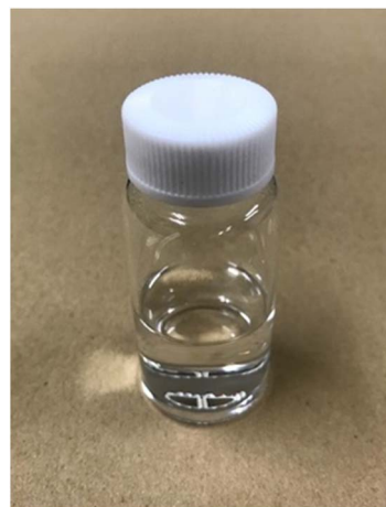
Fig. 40 Bio-ethanol made from bamboo waste as non-edible biomass. 178

My group also prepared 100% biomass biodegradable plastics from waste wood, bamboo, paper, newspaper, food, waste tofu, waste shochu (Japanese alcohol liquor), etc. In addition, we created plastics made from waste Sargassum , which is seaweed in the Caribbean Sea. Recently, the quantity of Sargassum there has been increasing because of global warming and the rich nutritious soil flowing into the ocean due to Amazon deforestation. In various places, including Antigua and Barbuda near the Caribbean, the state of Florida in the USA, Mexico, and some parts of South America, there are severe problems of decomposing Sargassum reaching the beaches, causing a foul smell. Thus, 100% natural biomass-based biodegradable resin pellets made from Sargassum waste were