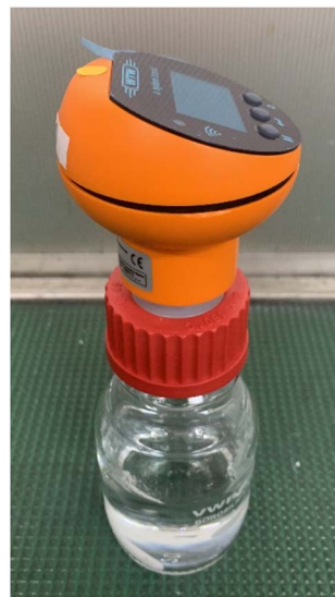
Fig. 3 Commercial biodegradability measuring machine.

Sapuan et al. prepared starch-derived bioplastic via the casting method. They used corn starch, water and plasticizer to prepare a starch-based film at 85 °C (Fig. 6). They demonstrated that