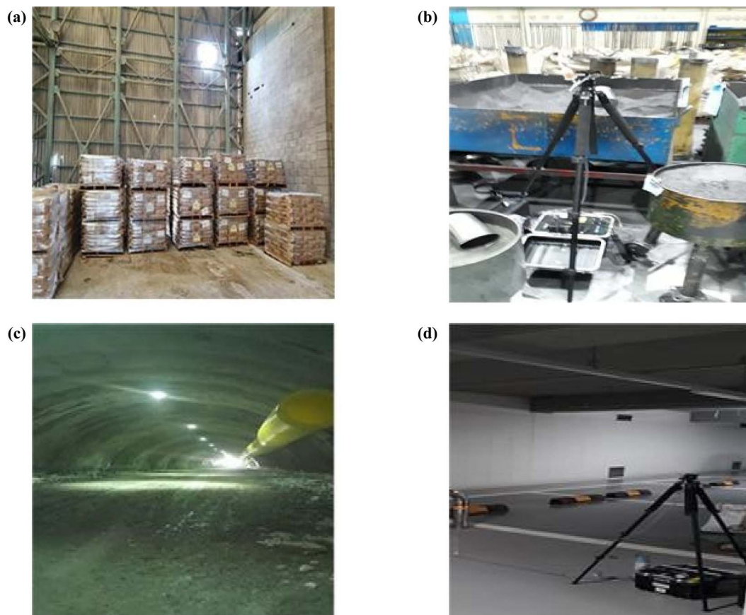
Fig. 1 Photographs of on-site radon monitoring (a) at a warehouse storing radon-containing raw materials; (b) during the moulding process at workplaces; (c) at an underground tunnel; (d) at underground parking lots in underground public-use facilities.

workplaces. The long-term radon measurements were required for a period similar to that of the workplaces, but some measurements were not completed due to repair at two facilities (B9 and B10). All measured radon concentrations were calculated using the international standard unit of becquerel per cubic metre ( \text{Bq m}^{-3} ).