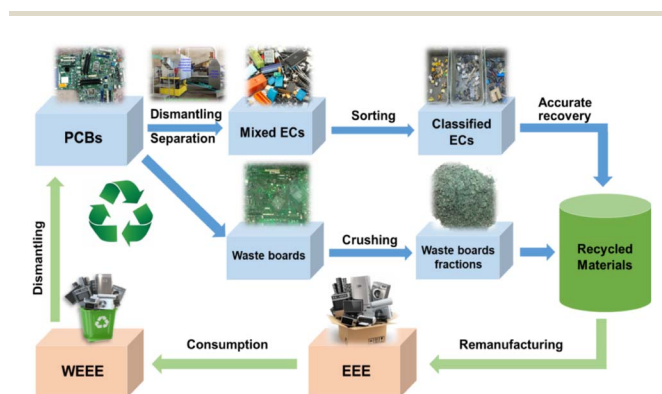
Fig. 3 Recycling flow chart of a PCB in WEEE. 71