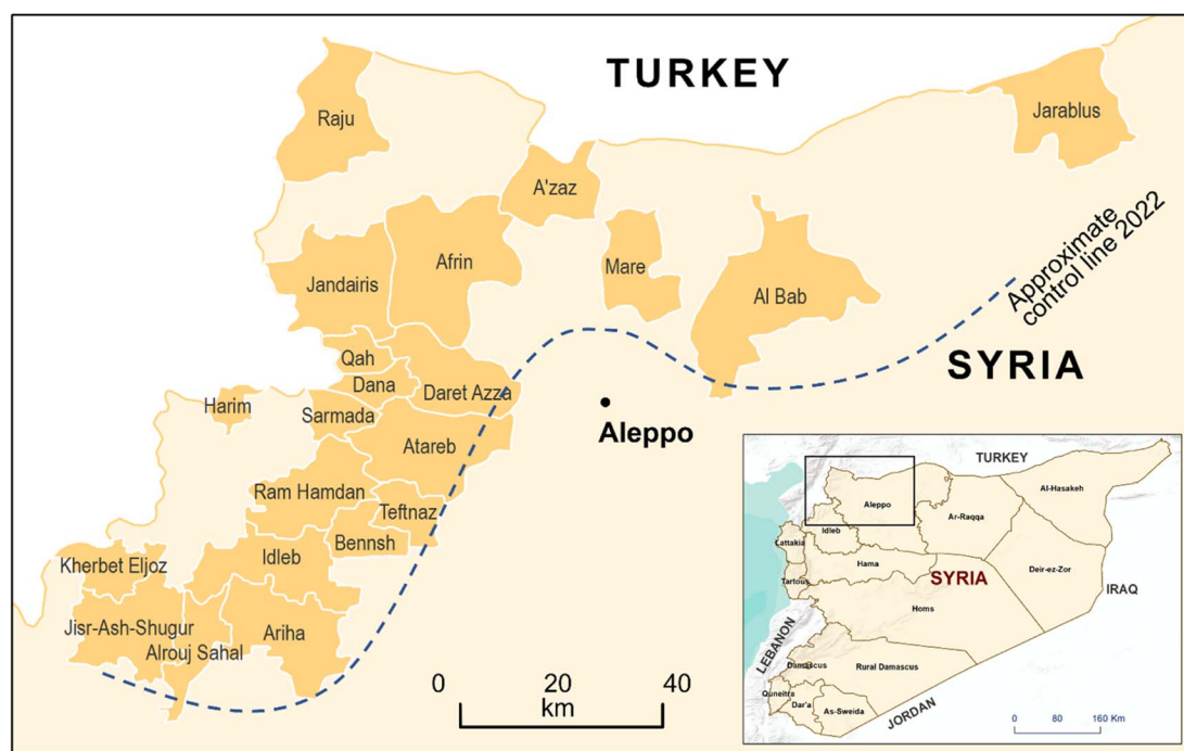
Fig. 1 Regional map showing 21 sub-districts sampled in this survey and their locations in the opposition-controlled region of North-West Syria. The dashed line indicates schematically the contested limit of Syrian Government control at the time of this study, shown for illustration only.

Several studies assessing potentially toxic element contamination in Syrian soils pre-dating the recent conflict exist (Table 1), although none of these present a broad regional survey. Möller et al. 18 assessed the extent and severity of heavy metal contamination of arable soils in the Damascus Ghouta whilst Husein et al. 19 measured the spatial distributions of Cu, Cd, Pb, Zn in the soil of the industrial Orontes floodplain around Hama, although the date of sampling is not stated. The concentrations of potentially toxic elements in cultivated soils