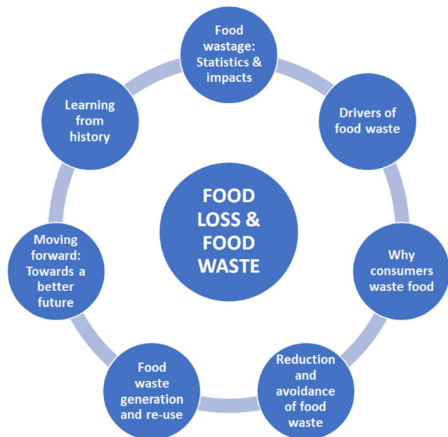
Fig. 1 Important considerations for building a future with less food loss and waste.

ordering). 3,13 There are still gaps in our understanding of food waste and food waste prevention. This paper is an attempt to highlight the multi-dimensionality of the food waste issue. It provides a historical perspective on food waste and attempts to clarify sources and definitions for various types of food waste, the evolution of food waste, means of reduction and food waste reuse, and means for approaching zero food waste systems. Fig. 1 depicts the important considerations for building a future with less food loss and waste.