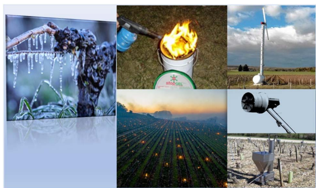
Fig. 2 Implementing active frost control techniques in vineyards (figure from the area of Saint-Émilion, Union of Producers, France https://vins-saint-emilion.com ).

The platform follows a bottom-up approach and comprises four building blocks: (a) decentralized data and in situ processing tools enable the capture and processing of data close to the sources. It integrates data from diverse sources such as in situ (IoT) sensors, RGB and multispectral images from drones, and Earth Observation data (EODATA/EODATA+) from Copernicus Sentinels, Landsat, and Envisat. (b) edge cloud analytics suite utilizes network edge processing and storage capabilities for efficient distributed processing and edge-driven Federated Machine Learning (ML). Explainable AI (XAI) justification is employed to enhance the end-user experience and foster trust in platform