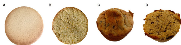
Fig. 1 Bakery products developed. (A) Control biscuit, (B) biscuit with 50% melon peel flour, (C) control muffin, (D) muffin with 100% melon peel flour.