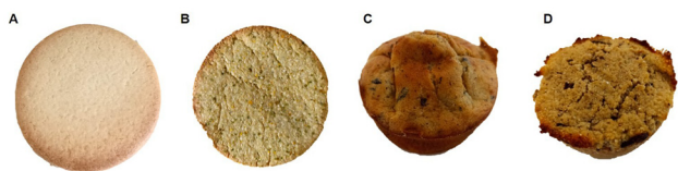
Fig. 1 Bakery products developed. (A) Control biscuit, (B) biscuit with 50% melon peel flour, (C) control muffin, (D) muffin with 100% melon peel flour.