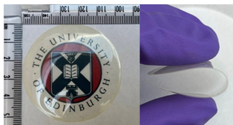
Fig. 4 A robust, optically clear, self-standing film of BTfMA-DPE fabricated from chloroform solution using the techniques of simple solvent-casting (5 cm diameter, 100 \mu m thick).

To conclude, BTfMA is a readily prepared monomer that has been demonstrated to undergo efficient polymerisation mediated by a superacid. When copolymerised with DPE , a rigid polymer with good film-forming properties is rapidly produced. It is anticipated that BTfMA has excellent potential for enhancing the permeability of membrane-forming polymers that are produced using superacid polymerisations by the introduction of greater free volume.