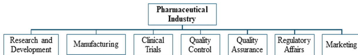
Fig. 2 Different processes involved in the pharmaceutical industry where AI can be potentially applied.