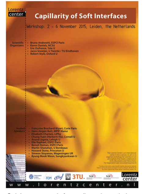
Fig. 1 This Opinion emerged from discussions during a workshop on Capillarity of Soft Interfaces, hosted by the Lorentz Center at the University of Leiden in November 2015. (Poster designed by SuperNova Studios, NL).