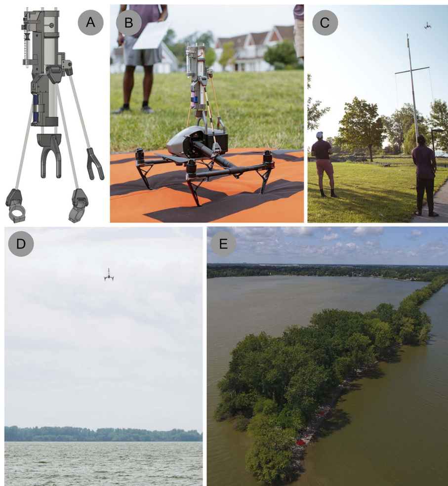
Fig. 1 (A) Engineering model of the AirDROPS package. (B) The AirDROPS attached to the DJI Inspire 2 platform. (C) Intercomparison flight of the AirDROPS adjacent to the sonic anemometer mounted on the flagpole. (D) Sampling mission at GLMS, 10 m above the surface of the water. (E) Drone image and aerial view of the sampling location at LE to the right of the point in the image.

disinfection using ethanol. The impinger was based on a design previously described by Powers et al. , 2018 21 adapted for use with a 15 mL polypropylene sterile conical centrifuge tube (CLS430791, Corning, Millipore Sigma). An aliquot of 2.5 mL of sterile water was added to the 15 mL conical tube immediately prior to each sampling mission. Two micro vacuum pumps (PN: SC3101PM, 21 Hualun Sci & Tech Pk 1st Ind Zn Fenghuang Village, Fuyong Town, Shenzhen, Guangdong, China) were used in parallel to supply a flow rate of 0.6 \text{ L min}^{-1} to the impinger. This flow rate was determined using an FTS Flow Calibrator from ARA Instruments (Eugene, OR, USA), and was optimized to ensure that the impinging fluid was not evacuated from the tube during the sampling mission ( i.e. , higher flow rates caused water to escape the tube into the vacuum pump). The collection efficiency of the impinger has been reported previously by Powers et al. 21 to be 75% for 1 \mu\text{m} polystyrene latex beads and 99% for 3 \mu\text{m} polystyrene latex beads. The inlet to the impinger was located 330 mm above the horizontal plane of the drone propellers to limit fouling of the sensor due to propwash (Fig. 1B). An optical particle counter (PMS7003, Plantower,