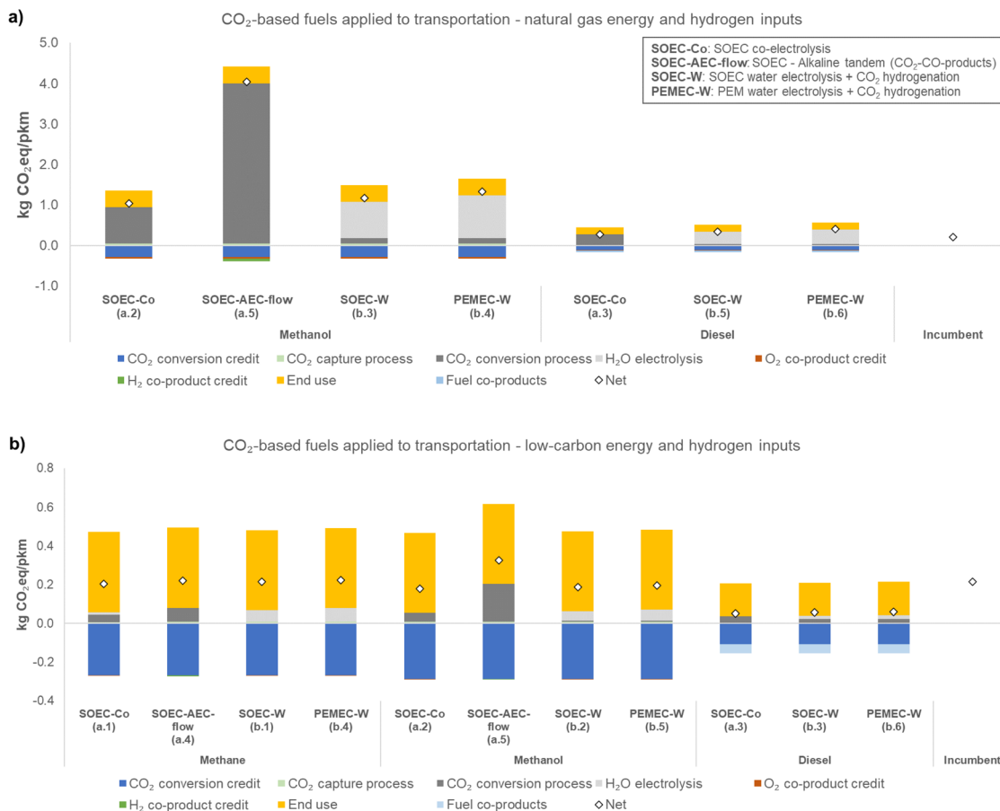
Fig. 3 Life cycle GHG emissions of transportation, with (a) natural gas-based and (b) low-carbon-based energy inputs, in kg CO 2 eq per pkm, for electrochemical and hybrid pathways. White diamonds represent the net GHG emissions which are the GHG emitted minus the CO 2 converted and the credits. x-Axis: SOEC-Co: SOEC co-electrolysis, SOEC-AEC-flow: CO 2 conversion in SOEC followed by AEC, SOEC-W: SOEC water electrolysis followed by CO 2 hydrogenation, PEMEC-W: PEMEC water electrolysis followed by CO 2 hydrogenation. Incumbent: conventional way to produce or generate a service. Pkm: passenger-kilometer. Note the y-axis scale difference between (a) and (b).

The hybrid pathway (SOEC-W, case b.2) also requires energy for separation, but this strategy has the advantage of heat integration within the system. The methanol synthesis process is exothermic, which allows the heat generated to be used in the distillation process, 73 reducing the external energy input. Regarding the AEC-flow, improvements in the electrochemical process itself ( e.g. , faster kinetics, improved stability, and higher selectivity) 22 and integration with other industrial processes that generate surplus heat that can be reused in liquid products separation may help the process become more competitive in terms of GHG emissions.