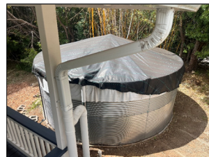
Fig. 2 Two weeks after the wildfire and the evacuation orders had been lifted, some fires were still burning, and various damage and household responses were observed.