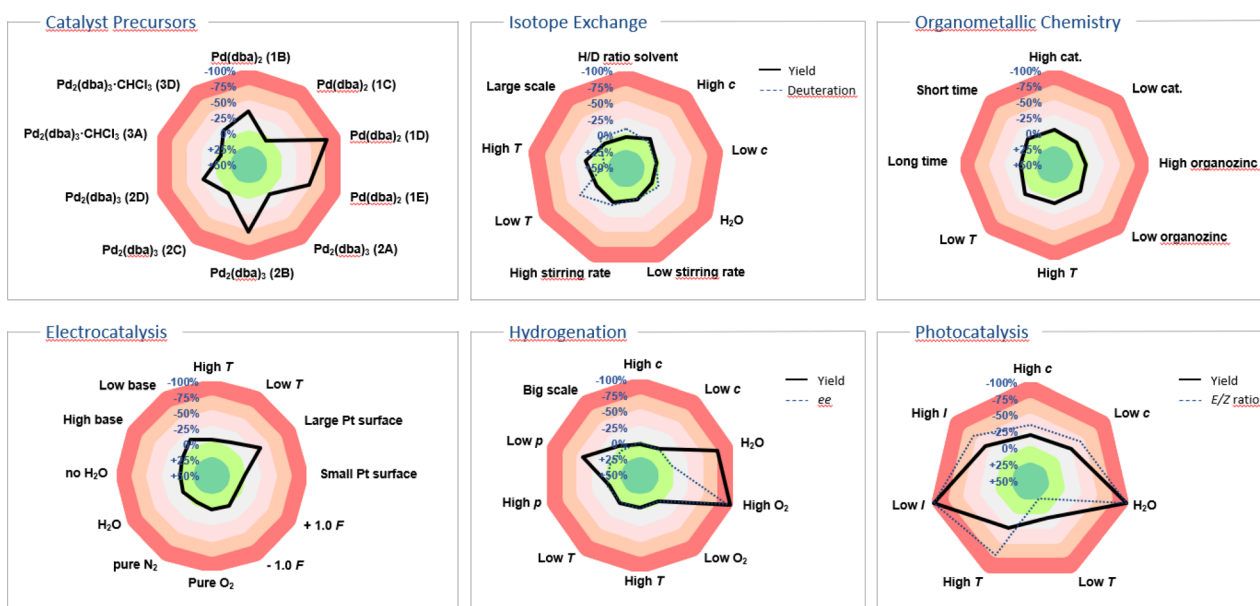
Fig. 2 Examples showcasing sensitivity screens tailored to diverse research fields. 13–16 In instances like hydrogenation, isotope exchange and photocatalysis the sensitivity screen was utilised to illustrate two target values, such as yield/deuterium incorporation, yield/enantiomeric excess and yield/ E:Z ratio, along with the parameters' impact on them.

Our innovation was embraced by the scientific community and has since been widely adopted for applications beyond the originally suggested ones. Originating from a background in photochemistry, we initially considered only yield as the target value and parameters such as: temperature, concentration, oxygen and moisture levels, light intensity, and scale. The use of the sensitivity screen within the scientific community, including our own group, has led to its adoption modified with additional parameters and target values. While the target value was formerly only yield, researchers have suggested and applied conversion, product ratio, selectivity, ee, throughput, TON, radiochemical yield (RCY), molar/specific activity ( A_m/A_s ), H/D -ratio, purity, space-time yield and enzyme activity, 12 and the standardisation of these terms has been a central achievement of the chemical community (Fig. 2). 13–16 Especially for industrial processes with more than one desired product, the reaction can be steered towards a customised product distribution, which might alter given the demand of the chemical product. A radar