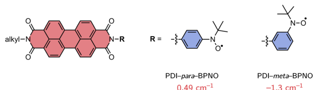
Fig. 3 Structures of the perylene diimide derivatives used for benchmarking and calculated values of J_{\text{TR}} using CASSCF/QD-NEVPT2.