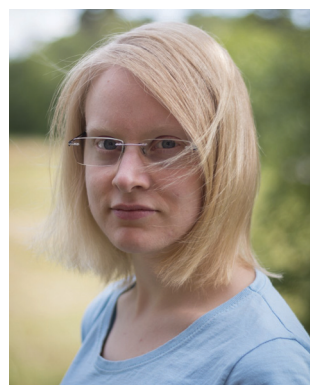
Hanna L. B. Boström

† Electronic supplementary information (ESI) available: The database of PBAs. See DOI: 10.1039/d2tc00848c