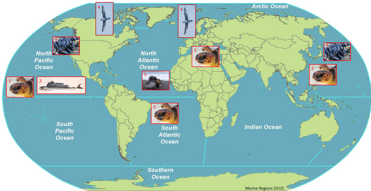
Fig. 2. Species used as plastic ingestion bioindicators around the world. 1: Loggerhead sea turtle Caretta caretta , one of five species used in the BEMAST and KIOST/MABIK/NIE programs, and also by MMA / IBAMA and the MSFD. 2: Longnose lancetfish Alepisaurus ferox , used by NOAA/UCSD program. 3: Blue mussel Mytilus edulis , used by PollutionTracker and KOEM. 4: Northern fulmar Fulmarus glacialis , used by AMAP and OSPAR. 5: Cory's shearwater Calonectris borealis , used by the MFSD. The North Pacific has the most bioindicator monitoring programs of any large marine region. There are currently no known monitoring programs from the South Pacific, Indian, or Southern oceans. See Table 1 for more details on the monitoring programs using these bioindicators. World map from https://marineregions.org/sources.php .