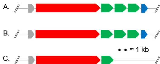
Figure 2. Schematic representation of (A) the PTM biosynthetic pathway in Lysobacter enzymogenes C3 encoding HSAF ( 1 ) [7] and the putative PTM pathways in (B) L. capsici DSM 19286 and (C) Saccharophagus degradans DSM 17024. Genes putatively coding for: Red: iterative PKS/NRPS system; Green: oxidoreductase; Blue: alcohol dehydrogenase; Grey: sterol desaturase (SD).

We next examined the utility of pSDsLcap to provide the hydroxylating SD biocatalyst in vivo. The plasmid was transferred into our recently reported E. coli BAP1 [14] based ikarugamycin ( 4 ) heterologous production system [8] by electroporation. Both the transcription of the ikarugamycin ( 4 ) pathway genes as well as of the SD gene from L. capsici were controlled by lacI . Fermentation of the resulting strain in ZY autoinduction media [15] revealed the exclusive production of the 3-hydroxylated derivative of 4 (see Figure 3D), a compound very recently isolated as the natural product butremycin ( 5 ) from Micromonospora sp. K310. [16] Ikarugamycin ( 4 ) was not