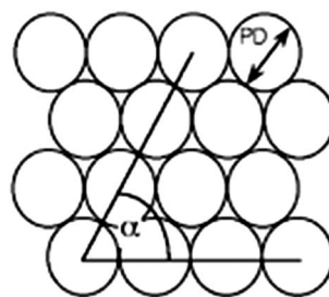
Fig. 8 The ideal hexagonal arrangement in the pores of a honeycomb structured porous film where alpha is the angle among three adjacent pores and PD is the pore diameter. Reprinted from S. D. Angus and T. P. Davis, Polymer surface design and infomatics: facile microscopy/image analysis techniques for self-organizing microporous polymer film characterization, Langmuir , 2002, 18 , 9547–9553.

Likewise, frequency distribution plots 2D and 3D (Fig. 9) contour plots of the first order near-neighbouring X–Y centers are obtained.