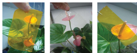
Fig. 3 Photos of cellulose/curcumin composite gel (a), cellulose (b) and cellulose/curcumin composite (c) films with 3 wt% curcumin.