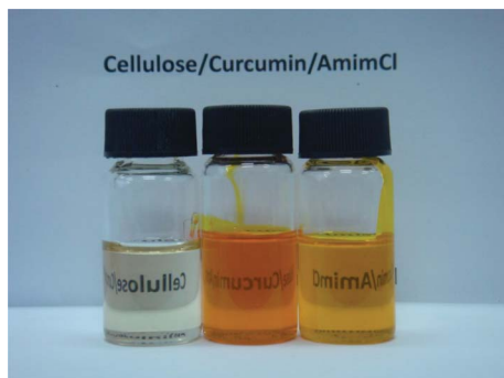
Fig. 2 The photographs of cellulose (left, 4%), curcumin (middle, 1%) and cellulose/curcumin solutions (right, 3% curcumin for cellulose) prepared with AmimCl solvent.

To evaluate the dispersion of the curcumin component in cellulose, SEM observations of the fracture surface of cellulose/curcumin composite films was carried out and the results are shown in Fig. 4. It can be seen that, when the curcumin content was below 4 wt%, the fracture surfaces of composites were compact and relatively smooth, which is similar to that of pure regenerated cellulose film. When the curcumin content was above 4 wt%, the fracture surface of cellulose/curcumin composite films became somewhat rough, but no obvious