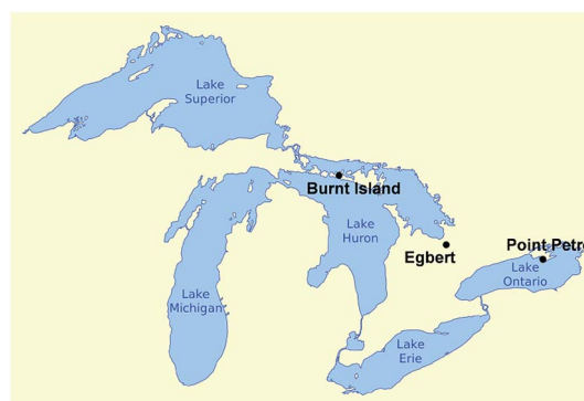
Fig. 1 Great Lakes Basin sampling stations.

Air sample collection procedures have been summarized by Wu et al. 20 In brief, air samples were collected (24 h integrated, approximately 350 m 3 volume) with a PS-1 high volume air sampler equipped with a glass fiber filter (GFF) and a polyurethane foam (PUF) plug to allow for separate determination of particle-phase and vapour-phase airborne contaminants. From