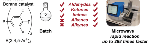
Fig. 1 Previous work on borane catalysed hydroboration with conventional conditions (top) and this work, assisted with enabling technologies (bottom).