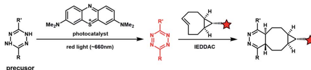
Fig. 4 Photocatalytic activation of the IEDDAC reaction.

Photocatalysts sensitive to red light have been utilized to trigger the formation of bioorthogonal substrates such as tetrazine for the subsequent bioorthogonal IEDDAC reactions (Fig. 4). 46 Visible-light catalysis has attracted great research interest in synthetic chemistry in recent years, 47 which resulted in a large pool of visible light-catalysed bond-forming reactions. Because visible light photo-redox catalysis based on ruthenium complexes has been applied to various chemical biological studies, 48 the adaptability of this large family of organic reactions to bioorthogonal reactions is worth exploring. 49–51 Fluorescent dyes such as fluorescein and rhodamine derivatives have been reported to catalyse visible light driven reactions in mammalian cells including neurons. 52 They may also be applied to photocatalytic activation of bioorthogonal reactions.