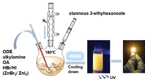
Scheme 1 Schematic diagram of the synthesis of the 2D (\text{RNH}_3)_2\text{SnX}_4 perovskites by a hot-injection method.

LEDs. 24 Ning's group reported hollow 2D layered (\text{HMD})_3\text{SnBr}_8 crystals synthesized by the antisolvent method. These crystals showed bright yellow luminescence with a PL QY of 86% and were used to fabricate remarkably stable WLEDs by mixing with commercially blue phosphor. 25 A (\text{C}_{18}\text{H}_{35}\text{NH}_3)_2\text{SnBr}_4 2D perovskite film was applied to produce orange LEDs, showing improved device performance than the 2D analogues, but the usage of toxic and expensive tri- n -octylphosphine (TOP) during the synthesis limited its large-scale application. 26 Recently, for the first time, our group synthesized highly emissive 2D tin-halide (\text{OCTAm})_2\text{SnX}_4 perovskites, in aqueous solution with a PL QY near unity and high stability in air. 27 We noted that Li's group reported the facile synthesis of 2D bulk tin-halide (\text{RNH}_3)_2\text{SnBr}_4 perovskites and explored the effect of different carbon chains on 2D organic tin-halide perovskites. 28