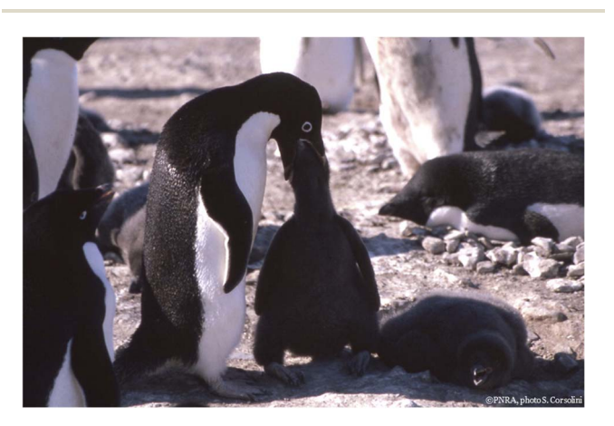
Fig. 2 An Adèlie penguin feeding its chick.

After the calving of the Nansen Ice Shelf (Ross Sea) in 2016, the foraging ground of Adèlie penguins (Fig. 2) changed and penguins fed in this newly accessible sea area.<sup>41</sup> A linkage between food item, ice coverage, foraging range, and POP contamination in Adèlie penguins from a rookery in the Ross Sea (Fig. 1) was already reported in the 1990s.<sup>44</sup> Here, a sequence of events occurred in the 1995/96 summer season: the ice melted completely very early in the season and penguins during the rearing chick period foraged nearer to the shore to save energy instead of swimming offshore for feeding on krill. The penguin diet during the rearing period is based on krill, which