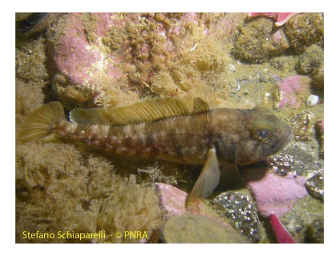
Fig. 3 A specimens of Trematomus bernacchi.

In order to compare with and complement observations in the Arctic, the following discussion focuses on POP temporal trends in marine fish and Adèlie penguins. These species are native to Antarctic marine environment and thus suitable to study temporal changes in contaminant exposure in this region. The Tables 1–4 report the concentrations of POPs in the most studied fish and penguin species. Among POPs, we selected PCBs, p,p'-DDT, p,p'-DDE, DDTs, and HCB since other chemicals, including emergent contaminants, were reported only in few articles.