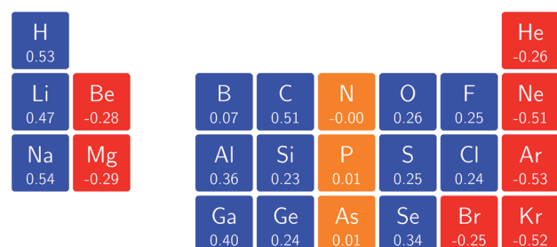
Fig. 10 Initial responses of the hardness in a magnetic field as a periodic table representation showing both the numerical values and categorising them with a color code in which blue indicates a positive derivative, red a negative derivative and yellow a derivative that is zero or close to zero.