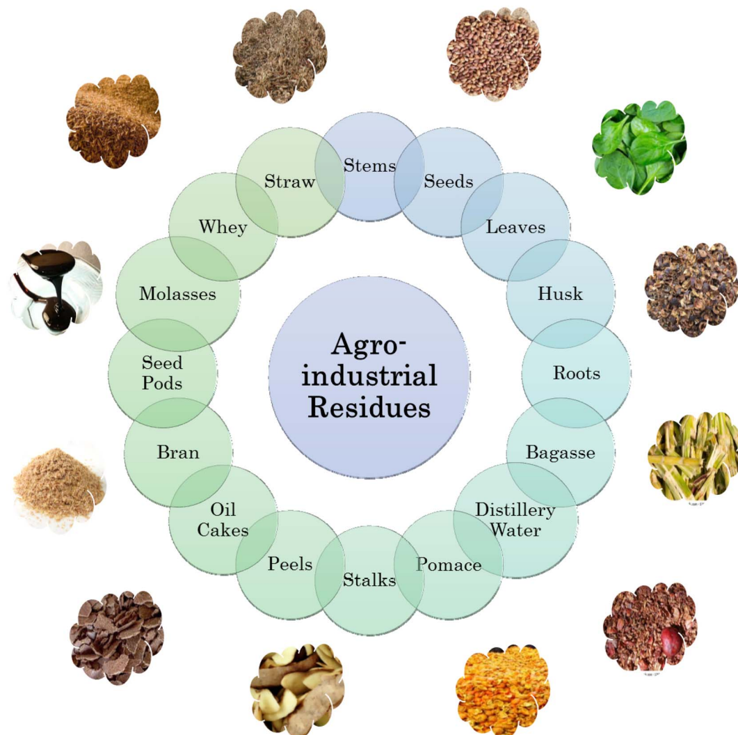
Fig. 4 Different agro-industrial residues used as substrate during biosurfactant production.

5.1.1. Vegetable oil and (oil) wastes. A large amount of waste residues formation occurs during the oil extraction in various oil industry. These left over products includes oil cakes, oil soap stocks, by-products rich in fat content, semisolid and water soluble effluents, fatty acid residues etc. 64