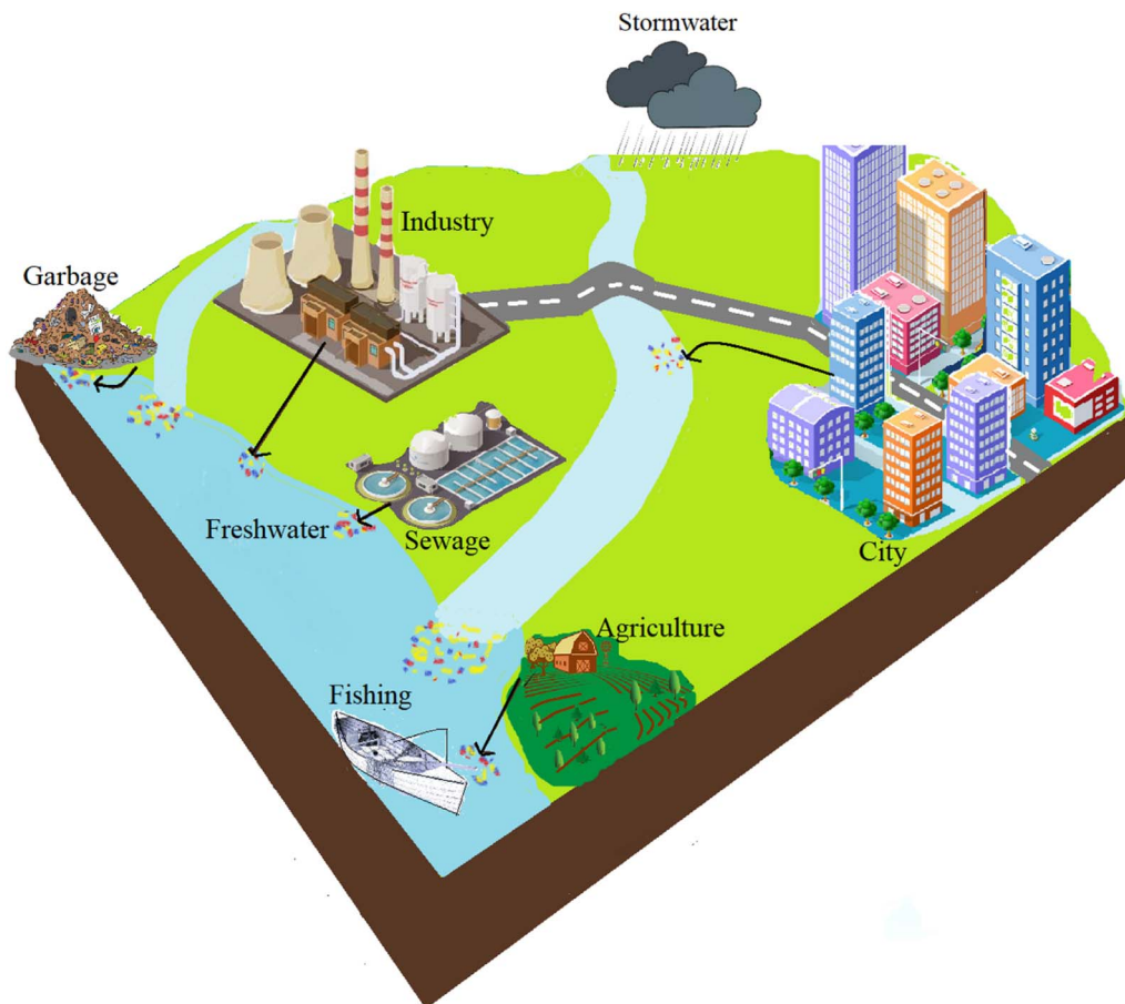
Fig. 1 Anthropogenic parameters affecting microplastics (MP) abundance in freshwater environment.

food resource, including the Chi River, Thailand. 6 In the study of MP abundance in three Gogian dams, the abundance of fibers was assumed to be related to fishing ropes and nets. 16