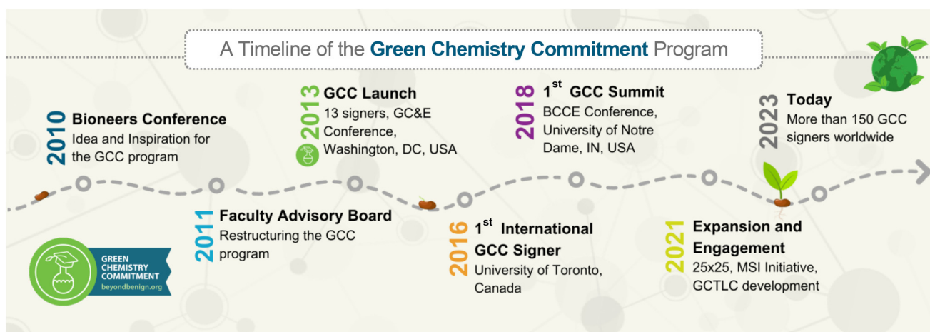
Fig. 1 A timeline of the Green Chemistry Commitment (GCC) program, which is composed of more than 150 higher education institutions worldwide as of December 31, 2023.

For the 25 × 25 Initiative, a combined total of $55 000 USD (37% of total GCC grant funding) has been awarded to 8 institutions in the U.S. to drive awareness and improve the adoption of green chemistry locally and internationally, and these numbers continue to grow. 34–36 The first Green Chemistry Challenge Award winners ( i.e. , Michigan State University; University of California, Berkeley; Southern University and Agricultural & Mechanical College) proposed the design of more than 10 teaching resources, thus helping to bring green