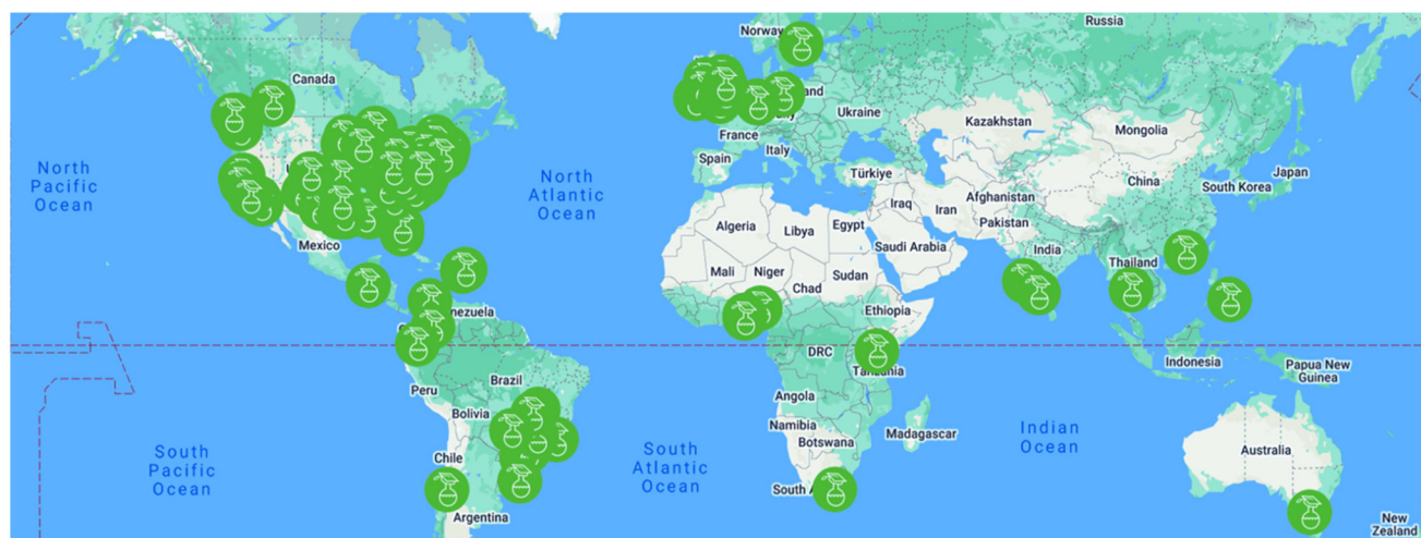
Fig. 3 Worldwide distribution of institutions participating in the GCC program. More than 150 GCC signers are based in over 15 countries, with communities outside of the U.S. representing 30% of the total number of participating institutions as of December 31, 2023.

By including green chemistry in higher education, our society can ensure that our scientists are trained in the most responsible way to assess and design molecular species that are inherently safer for themselves and their communities. Many companies worldwide have established diverse sustainability strategies, which require chemists with skills to address the environmental and societal impacts of the processes and products created. 49–54 In fact, the growth in demand for green skills (22.4%) already surpassed the share of green talent in the workforce (12.3%) between 2022 and 2023, and this